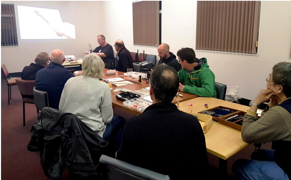
The first months Fly Tying Tuition in action.

The provision of materials requires that the club knows before each evening the number of members that will be attending. So please register your interest by email to barrie@flyfishinginxs.kiwi by 29NOV19. A follow up email will be sent directly to those who register their interest by that date.