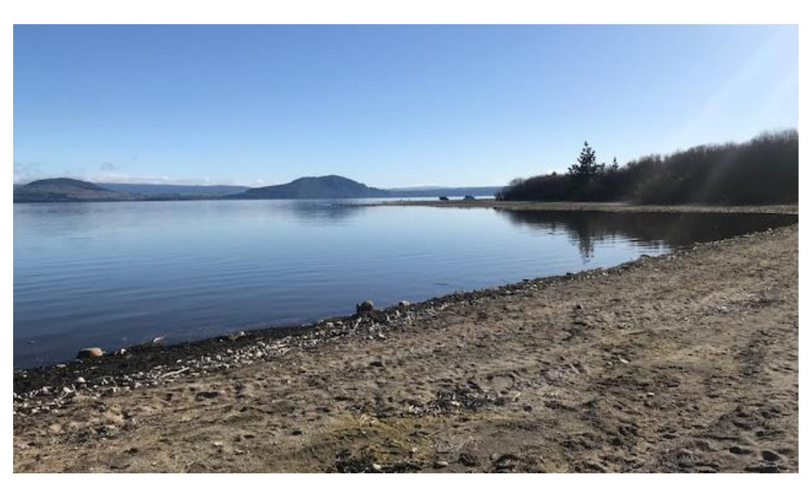
The Waimarino and Waiotaka River mouths, and a very low lake!