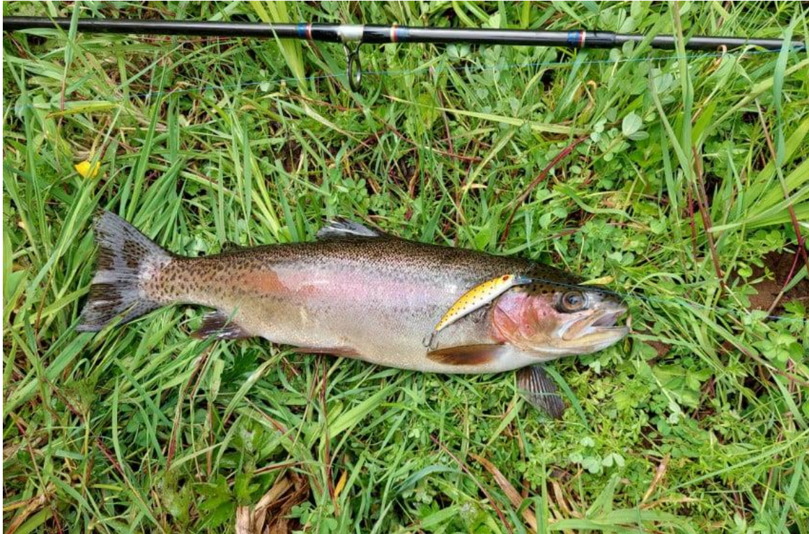
2lb Rainbow caught in the head waters of the Kaihu River.