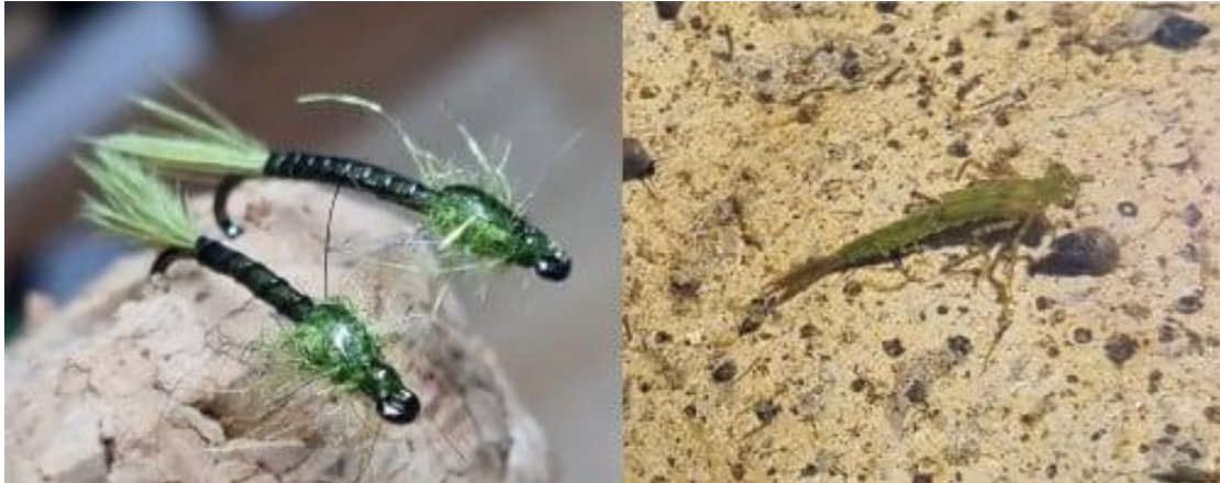
Damsel fly larvae are very energetic swimmers

And if you are venturing out to fish one of our many lakes don't forget this is the season damsel flies are highly active. Their larvae in particular are a favorite food of stillwater trout with their wriggly swimming action being hard to resist. A slow jerky retrieve under a floating line around weed beds and vegetation that extends above the surface is the key.