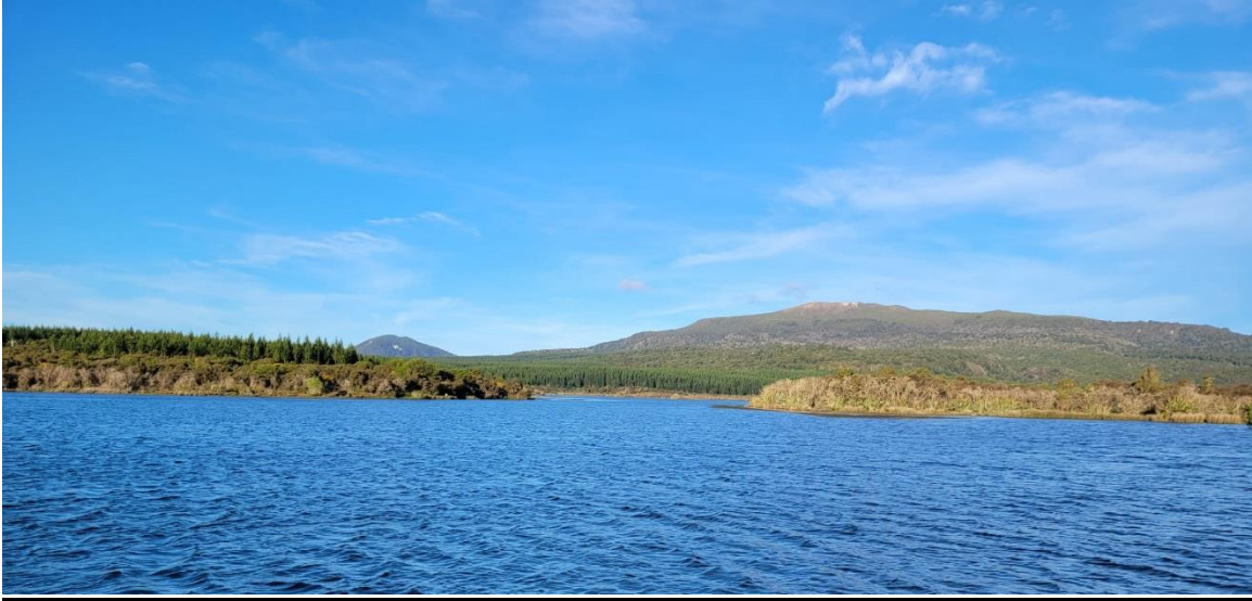
Lake Otamangakau on a fine day, nothing beats it...unless the wind is howling. Looking back down the northern arm of the lake.