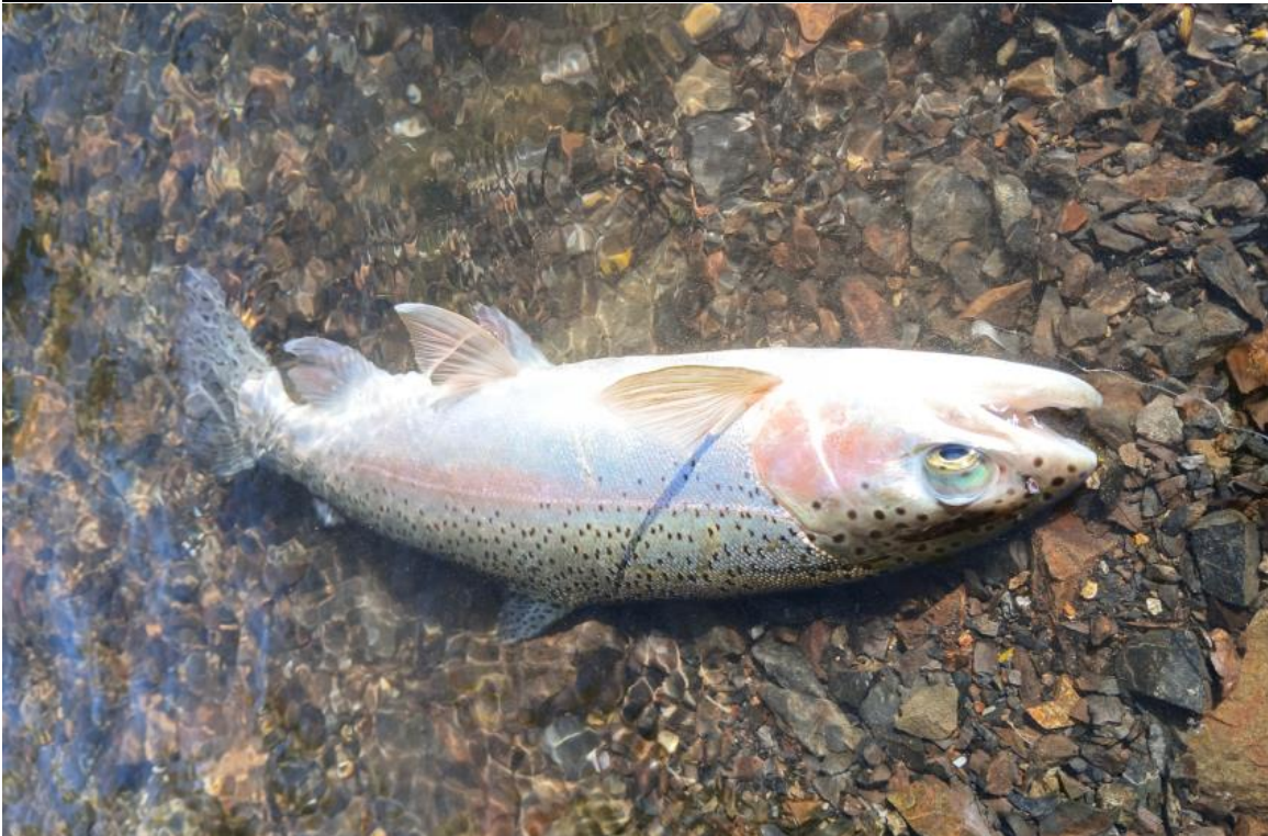
Karapiro Dam Rainbow trout caught on a soft bait.