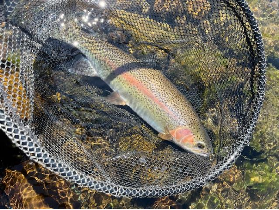
A beautiful fat Coromandel Rainbow on a stunning summer day. What more could you ask for.

you false cast it just adds another thing that can go wrong, not to mention the longer your flies are in the water rather than the air the more fish you will catch.