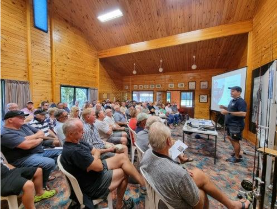
Be more successful fishing for trout

No bookings are required, it's all free, plus we'll be giving away a few spot prizes! For more information contact Mark, msherburn@fishandgame.org.nz