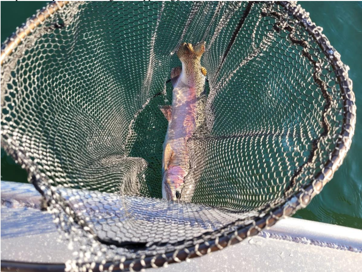
A Big O rainbow still showing some signs of the spawning season, but it put up a heck of a fight. Come the March Club Trip this will be an absolute cracker!

The Tongariro is still getting the odd fresh run fish and a few big Browns are being seen. Most fish have been recovering from spawning and small, size 14 to 16, Hare & Coppers / Pheasant Tails / Caddis have been getting the best results. On top of this there is always the possibility of an evening rise happening just before and after dark.