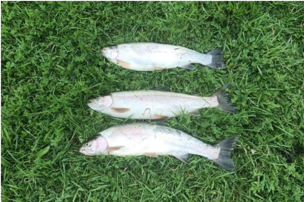
A limit of plump trout taken from Whau Valley Dam recently