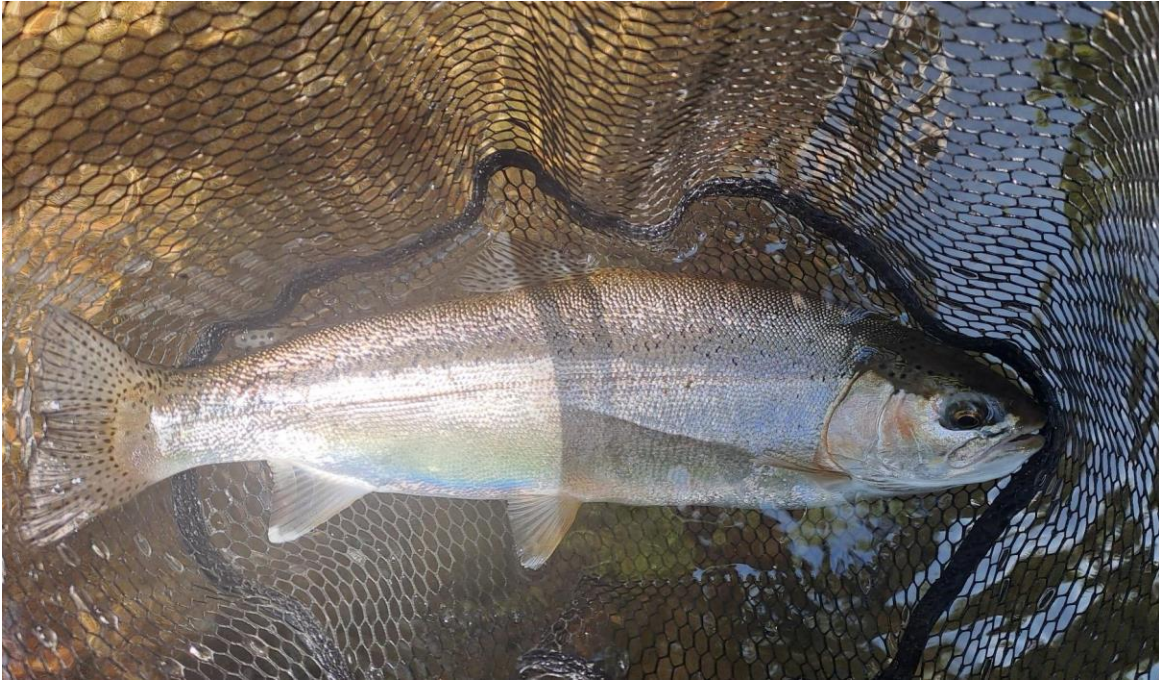
One of Mitches backcountry stunners.

Fill in your fishing diaries here to help us manage the Eastern Fish & Game region. Participants go in the draw to win a $100 voucher from Kilwell: https://www.surveymonkey.com/r/QRSD7D3