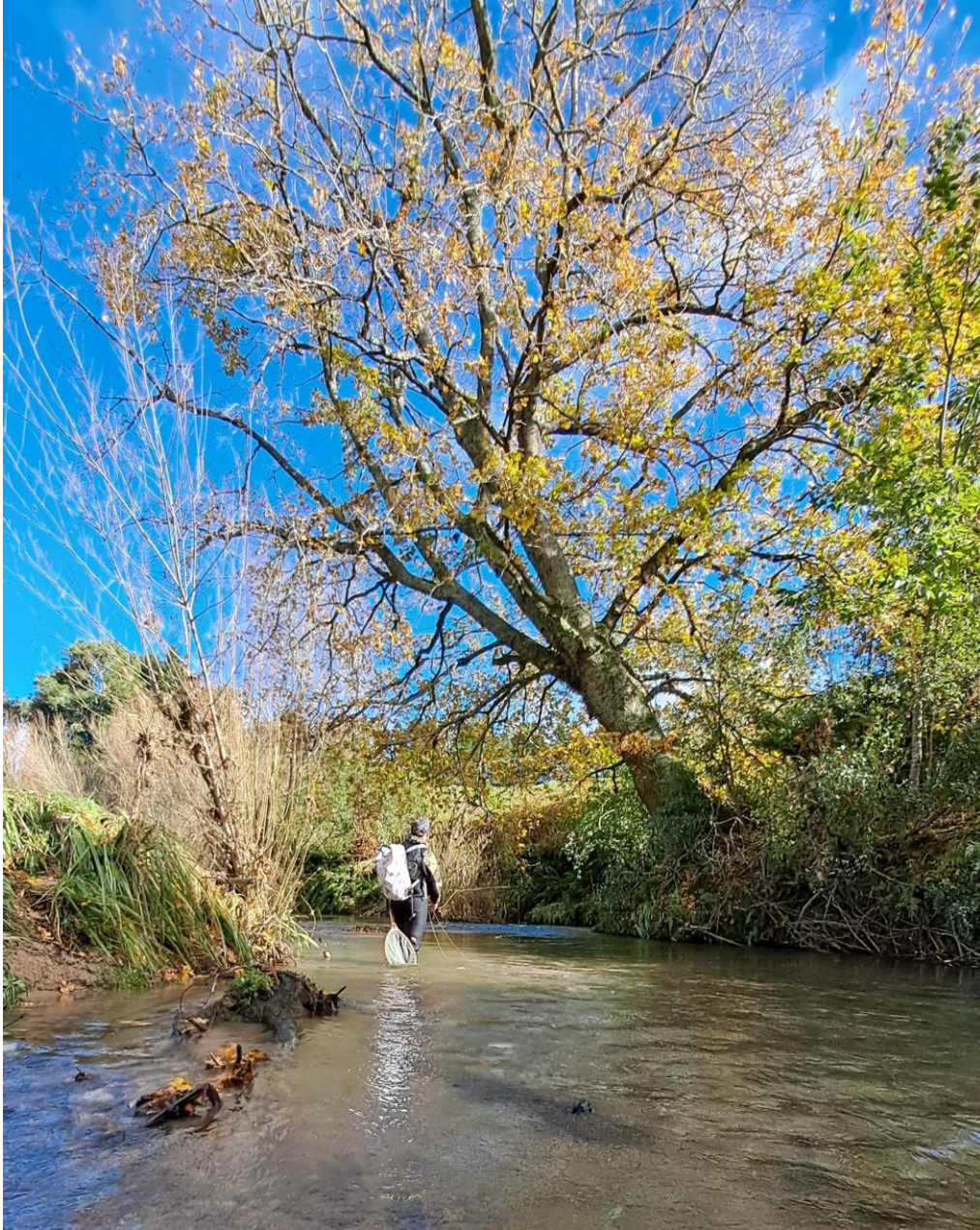
Mitch in action not far from the Lodge during last year's Ngongotaha Club Trip.

This 'how to' YouTube video clip is an oldie but a goodie. It covers the fundamentals of the technique, including the gear you will need. If you want to get up to speed quickly take a look at Jigging on Lake Taupō >