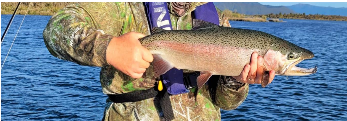
The 'Big O' fish can be hard to catch at times, but when you do they are immensely memorable.

Dave Symes - Ph: 09 486-6257 - Email: dssymes@xtra.co.nz