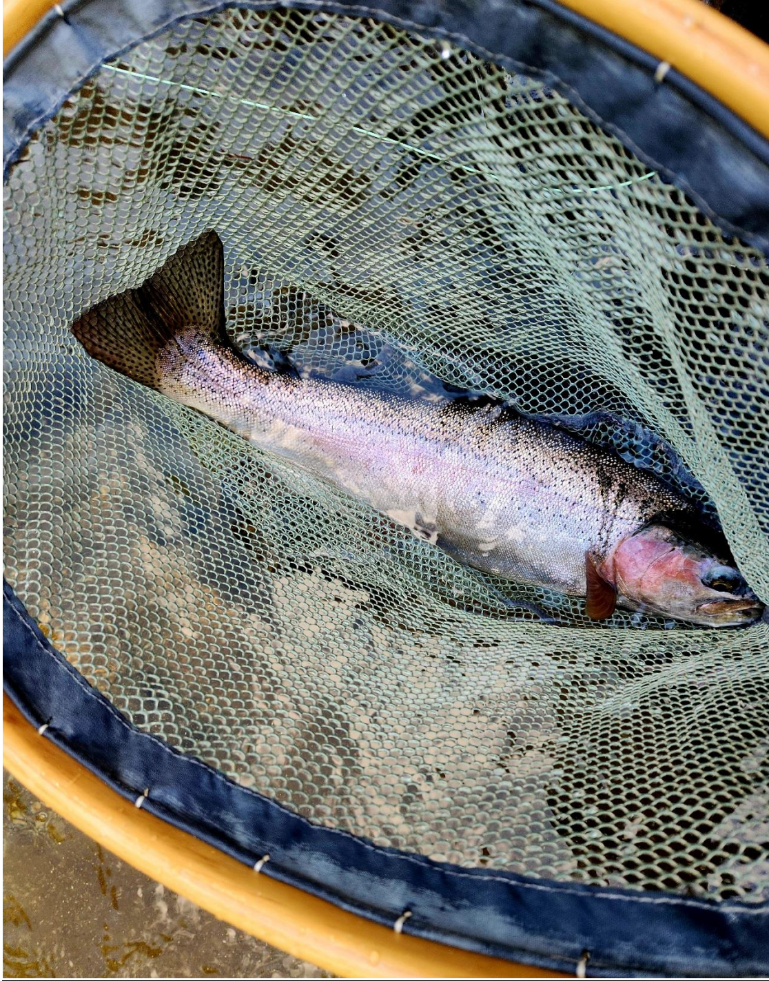
A beautiful Mohaka Rainbow from a beautiful river.