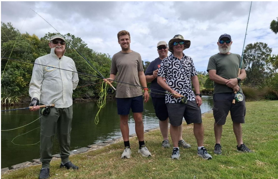
The 'Crew' at the first Casting session at Onepoto Park.

Some pics follow of the different events: