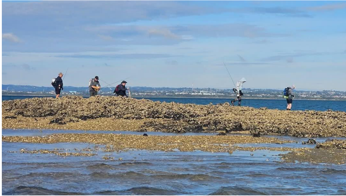
After a long walk out the Boys start picking their spots on The Reef.