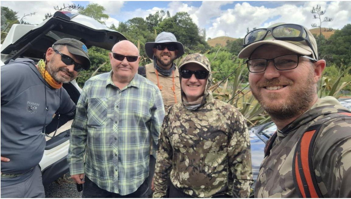
A beautiful day in a beautiful part of the country, and some fish thrown into the mix as well. What more could you ask for.