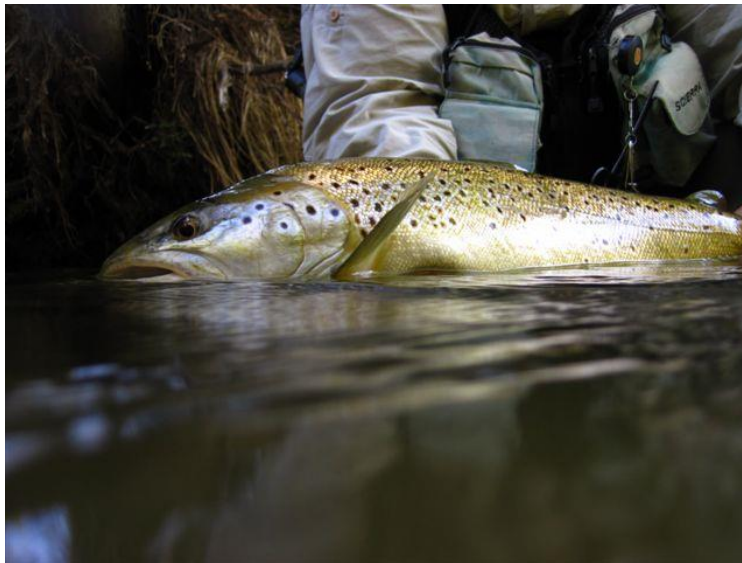
9pds of February caught Ngongotaha Brownie. They're waiting for you...