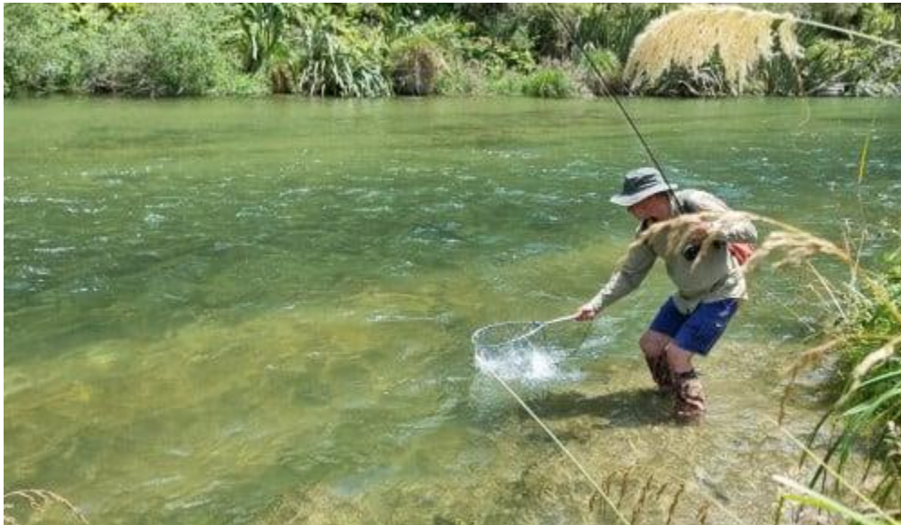
Low clear conditions are a feature currently of many BOP streams

Cicada action has been patchy throughout the Eastern Fish & Game region thus far this summer. Dry fly-dropper combinations have been fishing well and evening caddis and mayfly hatches have been abundant. Rivers are low and clear and fish spooky. Most catchments would benefit from a little rain.