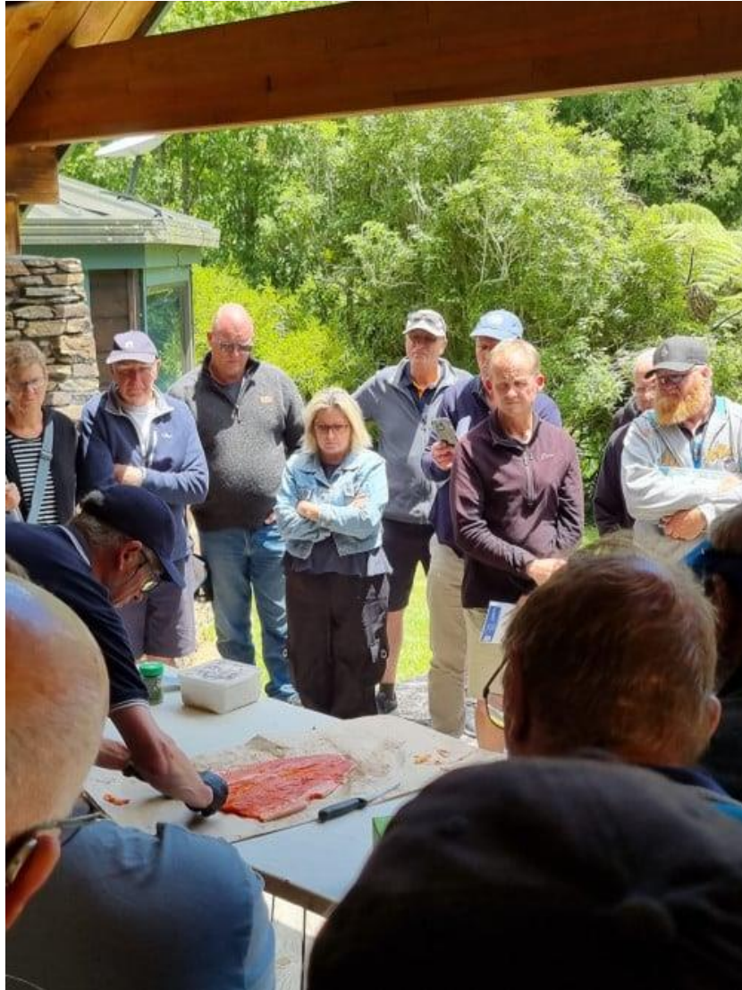
De-boning a trout before hot smoking it.