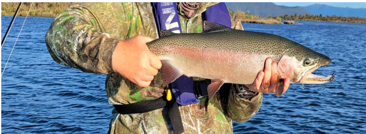
The 'Big O' fish can be hard to catch at times, but when you do they are immensely memorable.

Dave Symes - Ph: 09 486-6257 - Email: dssymes@xtra.co.nz