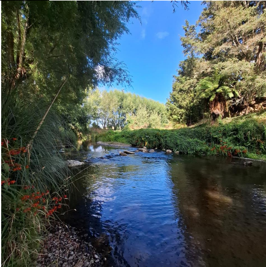
Beautiful water on the Club Day Trip, even in very low conditions.