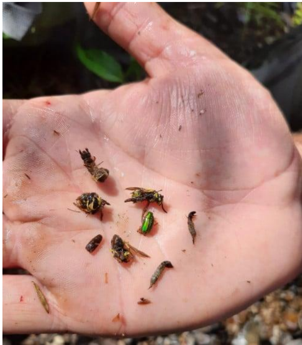
The stomach contents of a trout from the Kaimamaku Stream showing wasps and beetles in the diet.

Trout are concentrating on deep and shaded pools at this time of year. So vegetated parts of the river and deep runs should be the target areas. Dry flies such as blowfly and cicada imitations can induce some exciting takes, and the usual performers like velvetic spinners are still working well.