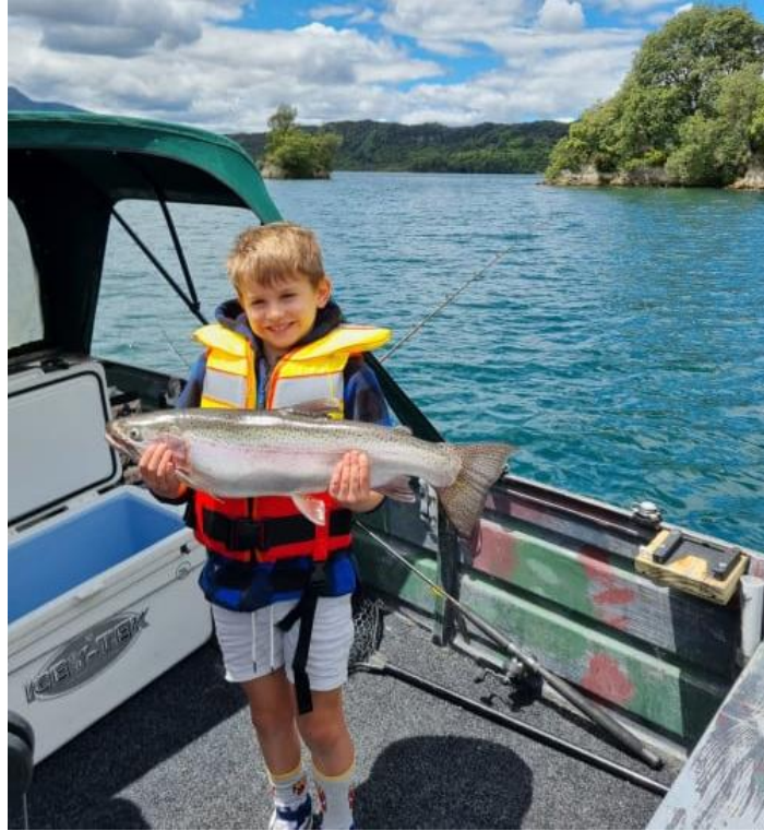
Another sold fish from Tarawera